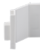
STAS cliprail max combi cap white RY10100 (2 x end cap / 1 x corner cap)