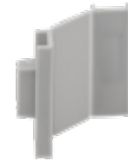
STAS cliprail max combi cap alu RY30100 (2 x end cap / 1 x corner cap)