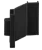
STAS cliprail max combi cap black RY20300 (2 x end cap / 1 x corner cap)